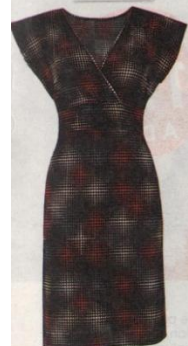
Dress, £14, Peacocks