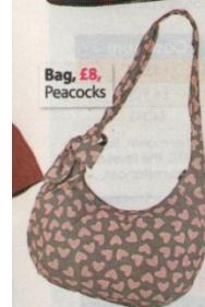
Bag, £8, Peacocks