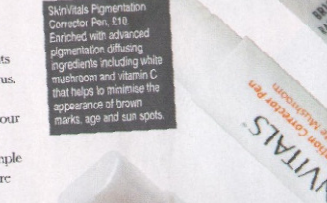
SkinVitals Pigmentation Corrector Pen, £10. Enriched with advanced pigmentation diffusing ingredients including white mushroom and vitamin C that helps to minimise the appearance of brown marks, age and sun spots.