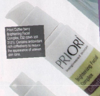
Priori Coffee berry Brightening Facial Complex, £32 (999 935 2121). Contains antioxidant with coffeeberry to reduce the appearance of uneven skin tone.