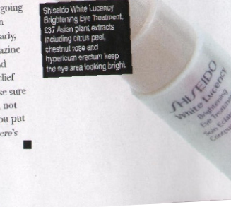
Shiseido White Lucency Brightening Eye Treatment, £37. Asian plant extracts including citrus peel, chestnut rose and hypericum extract keep the eye area looking bright.