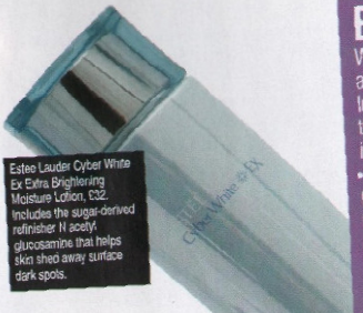
Estee Lauder Cyber White Ex Extra Brightening Moisture Lotion, £32. Includes the sugar-derived refinisher N acetyl glucosamine that helps skin shed away surface dark spots.

The one absolute fact to remember is that once the damage has been done, there's no going back. But we're not here to judge. If women want to purchase a beauty product and, clearly, many of you do - our job as a beauty magazine is to recommend the best and the safest, and remind you that we exist to promote the belief that brown equals proud. If you must, make sure you use these creams because you want to, not because you feel you have to. Because if you put yourself at risk just to fit in with society, there's little hope of that society ever changing.